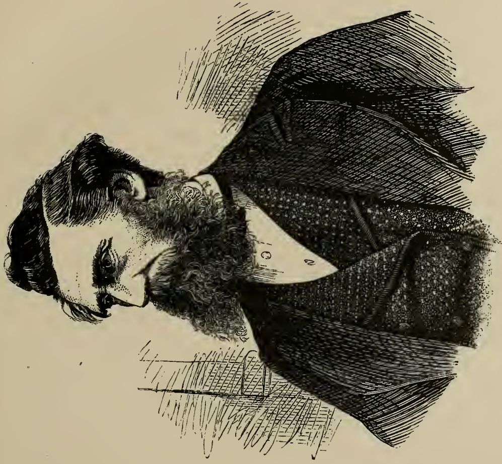
D. Murray Esq

FIRST GRAND MASTER OF THE GRAND LODGE OF SCOTLAND, 1736.